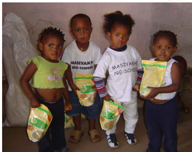
Food4Africa food bags at the Masiyake Pre-School, Port Elizabeth — April 2006